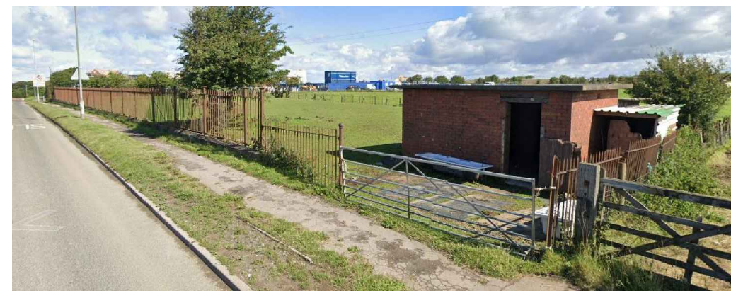
EXISTING STREET VIEW