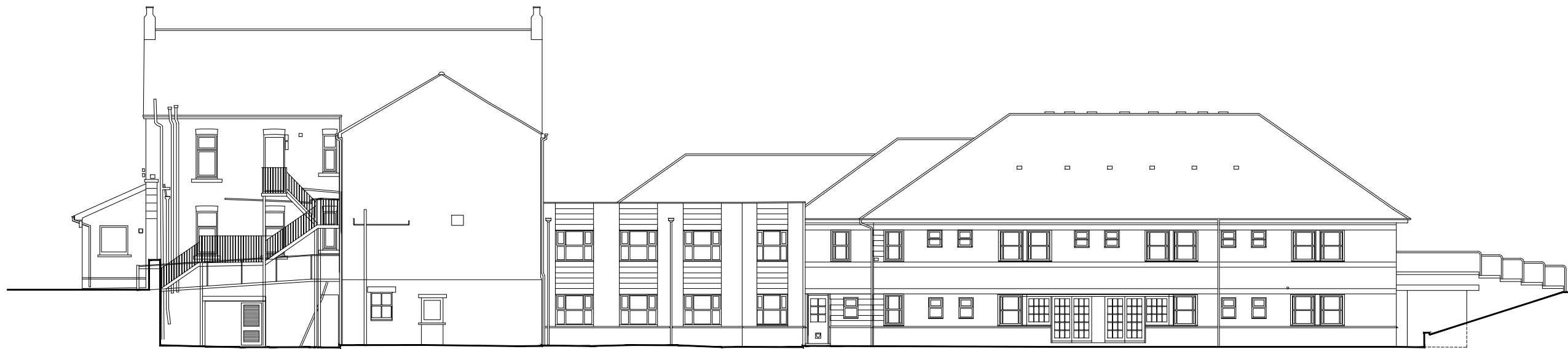
E.23 Existing East Elevation