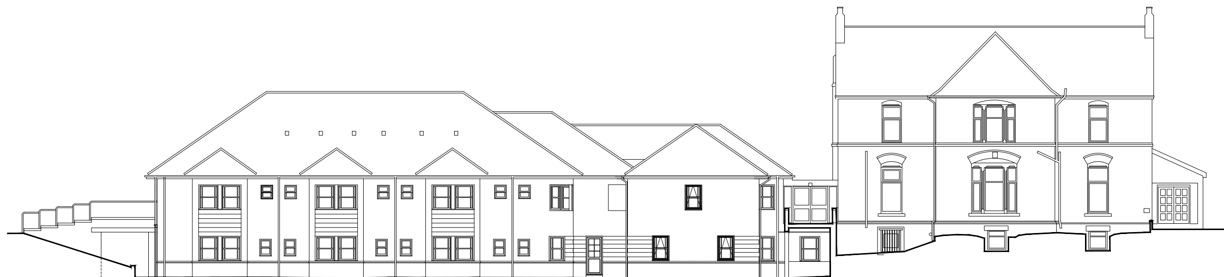
E.24 West Elevation as Existing

MATERIALS Walls red facing bricks, buff multi facing brick plinth, Sandstone features, pink sandstone plinth Roofs Natural slate Windows white sash frames Rainwater Goods black upvc