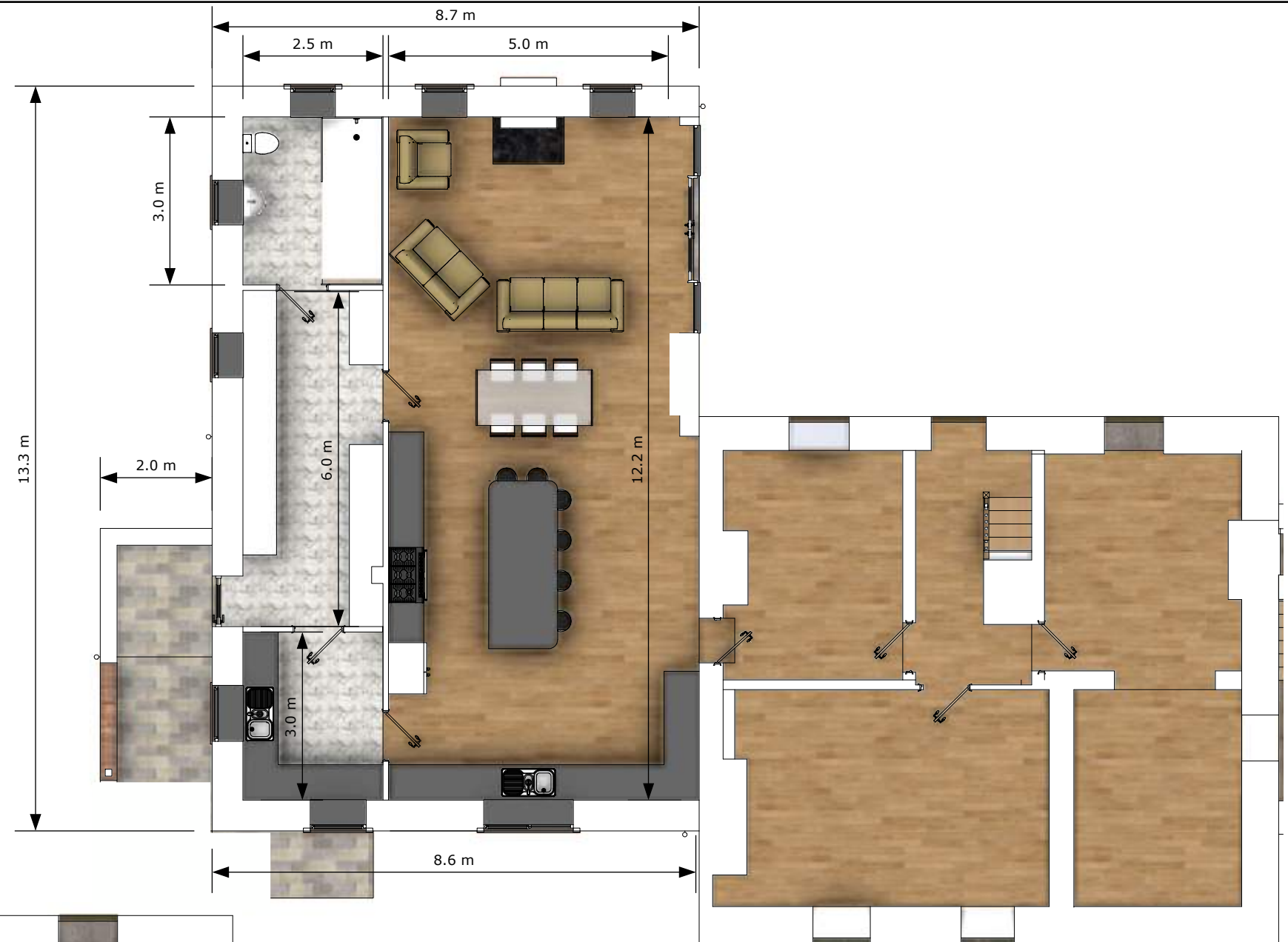
Proposed Ground Floor Plan Scale 1:100