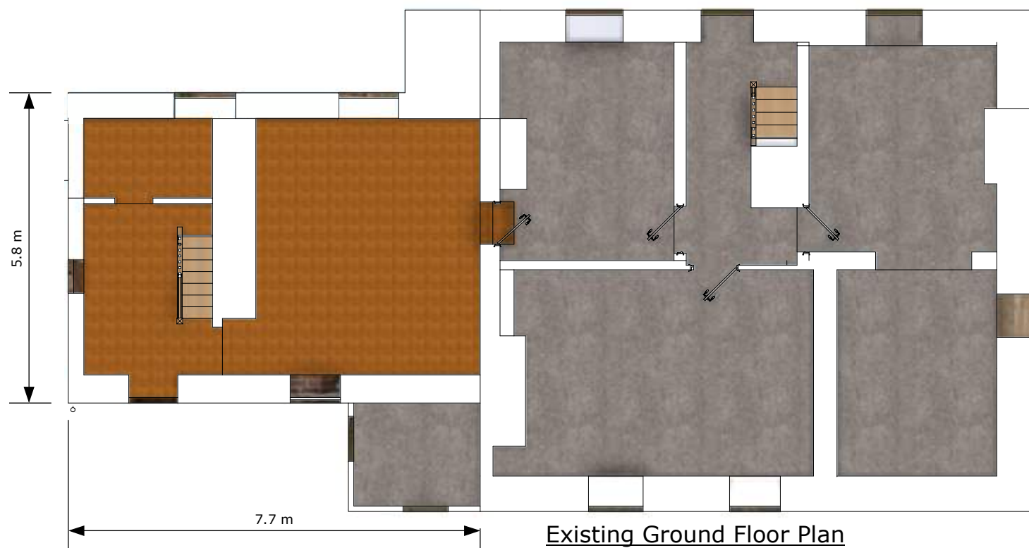
Existing Ground Floor Plan Scale 1:100