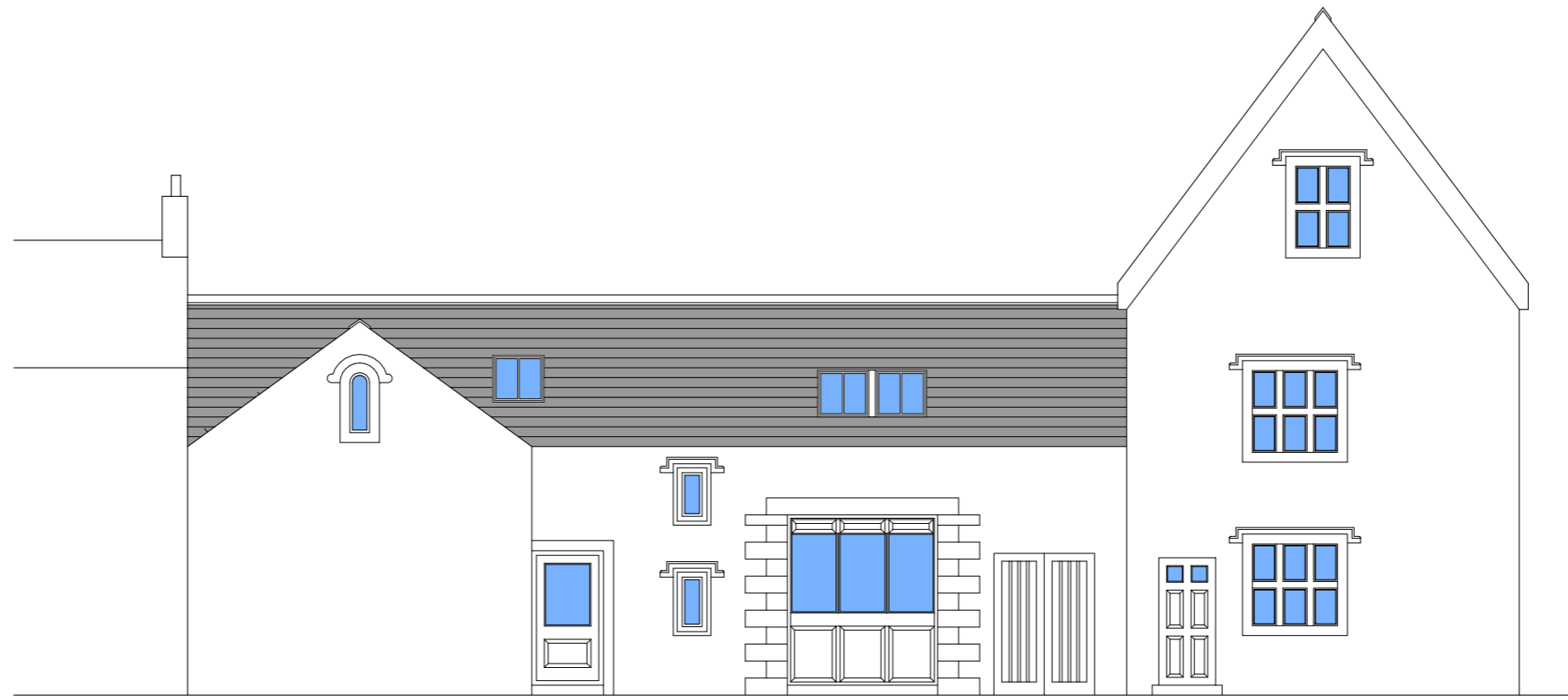
proposed front elevation 1: